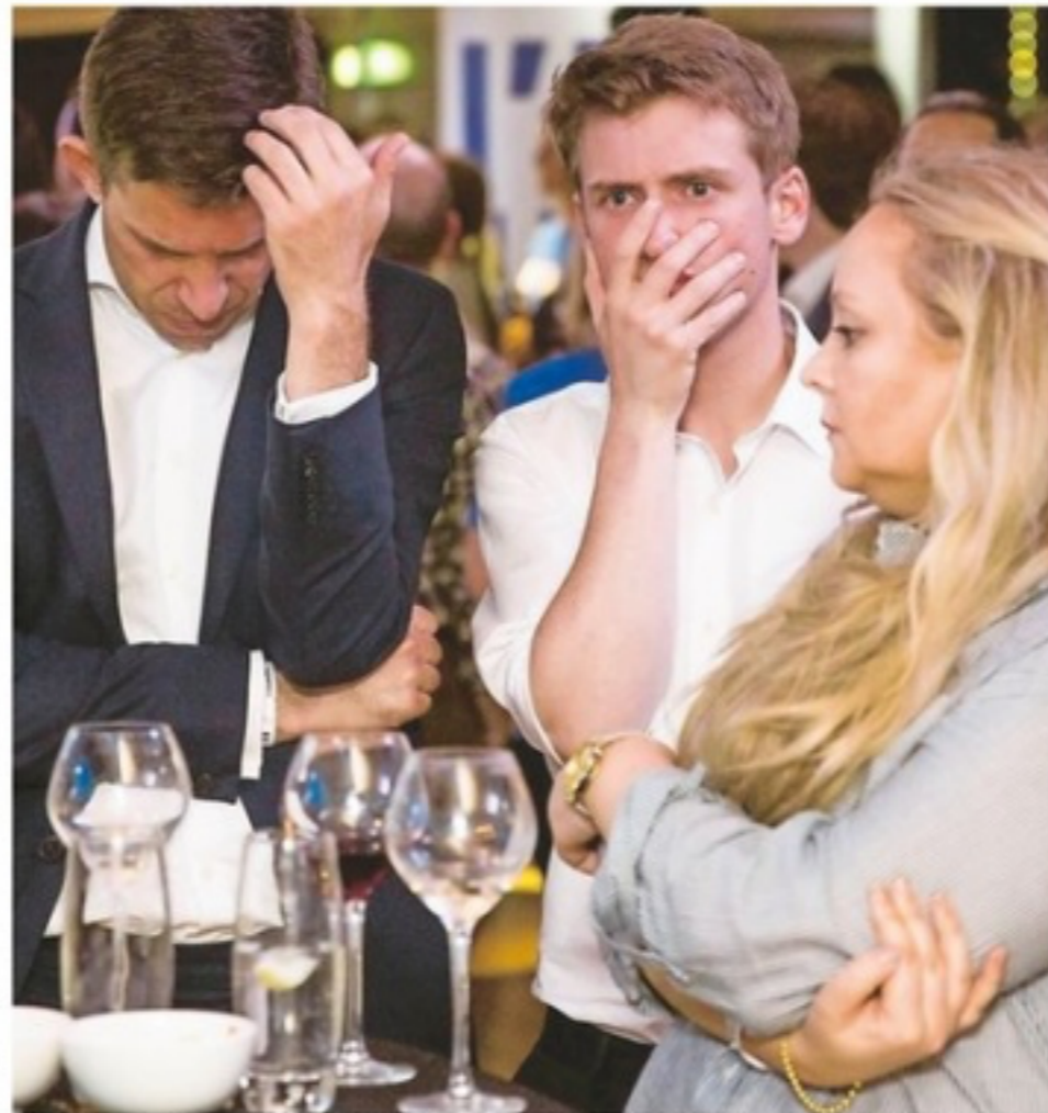
Stronger in supporters react with dismay as they bear results at London's Royal Festival Hall

There was a tense mood in Downing Street while Labour remain campaigners