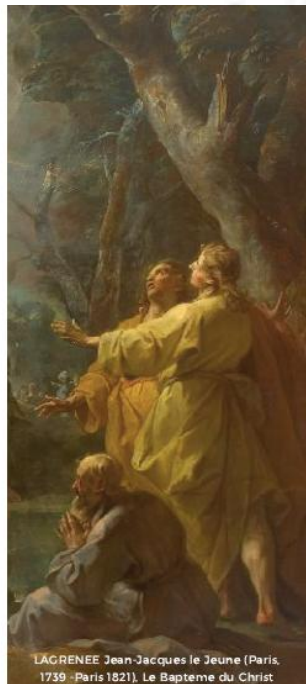
LACRENEE Jean-Jacques le Jeune (Paris, 1739 - Paris 1821), Le Baptême du Christ