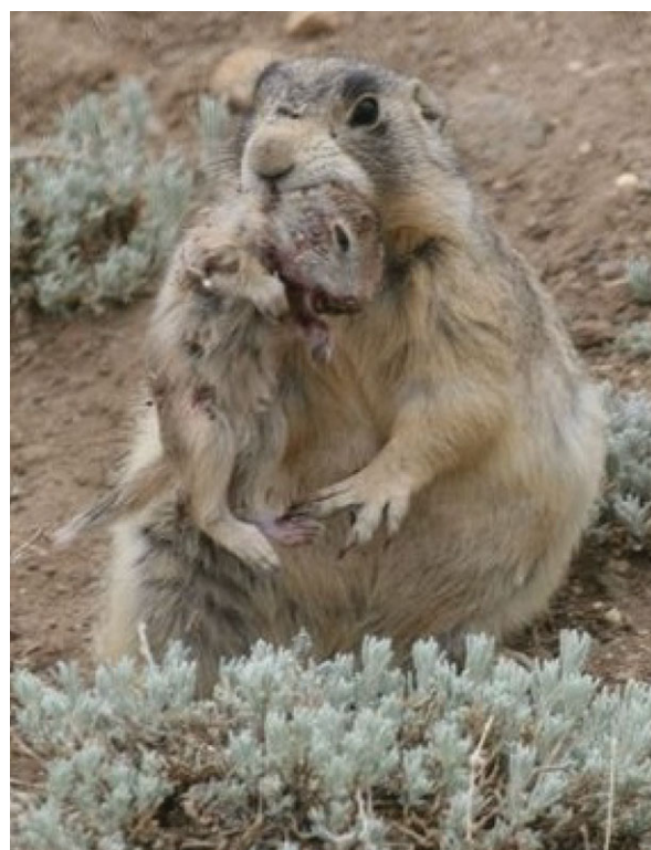
Figure 2. One-year-old female prairie dog that has just killed a ground squirrel juvenile via a series of bites to the neck. (Online version in colour.)