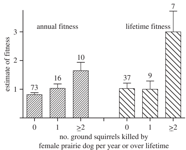
Figure 3. Mean \pm s.e. annual fitness and mean \pm s.e. lifetime fitness for female prairie dogs versus the number of ground squirrels they killed. Both measures of fitness increased significantly with the number of victims ( p \leq 0.001 ; see Results). Number of ground squirrels killed is the number per year for annual fitness and the cumulative number over a female's lifetime for lifetime fitness; see text for definitions of annual and lifetime fitness.

The number of ground squirrels killed by a female was the only significant predictor of annual prairie dog fitness at