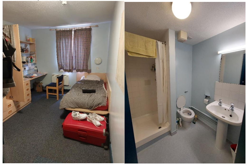
The view from my bedroom

Photos of my room (all the rooms are almost the same