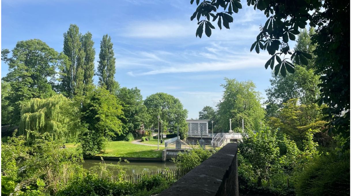
A parc in Bruges.