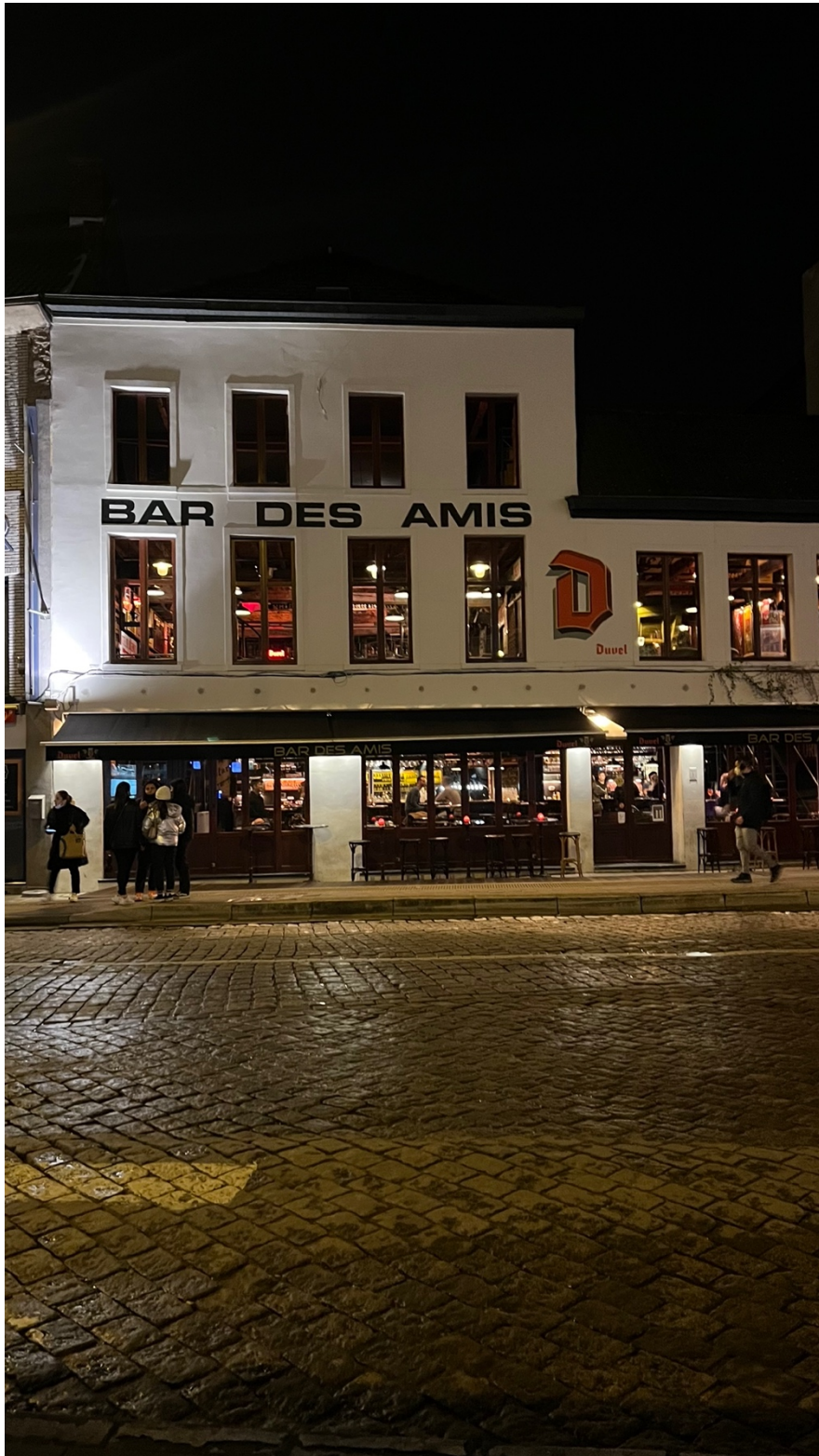
bar and one of the best.