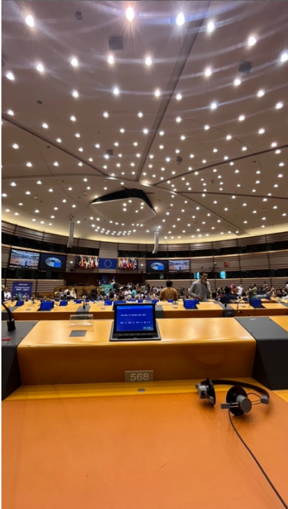
The European Parliament in Brussels.