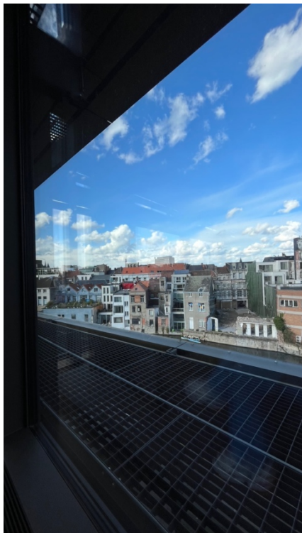
The view from the Bibliotheque The Krok.