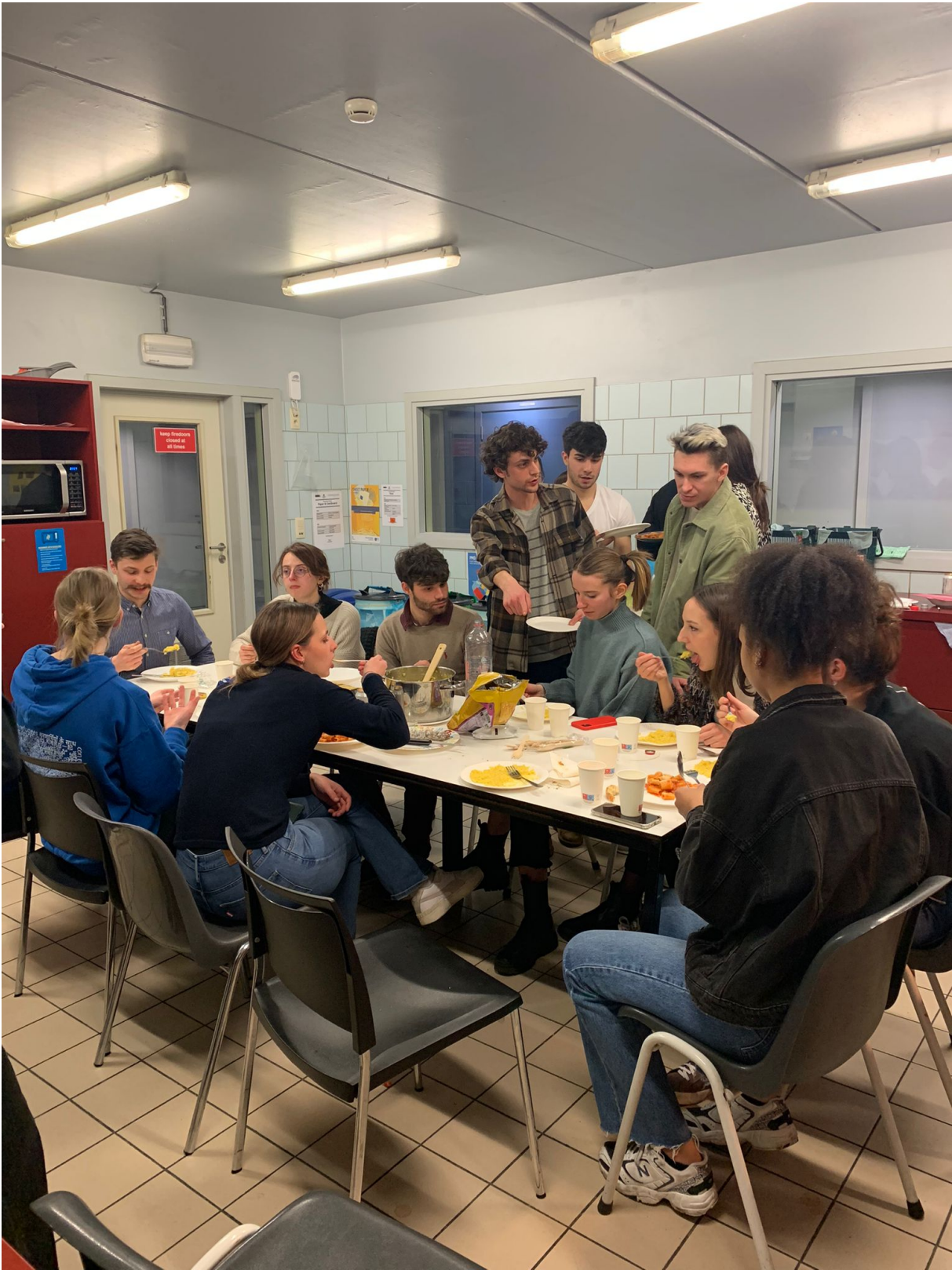
One of the kitchen from our floor during an Italian dinner.