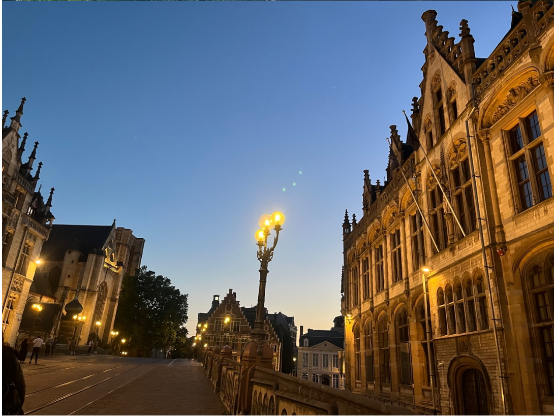
Ghent by night.